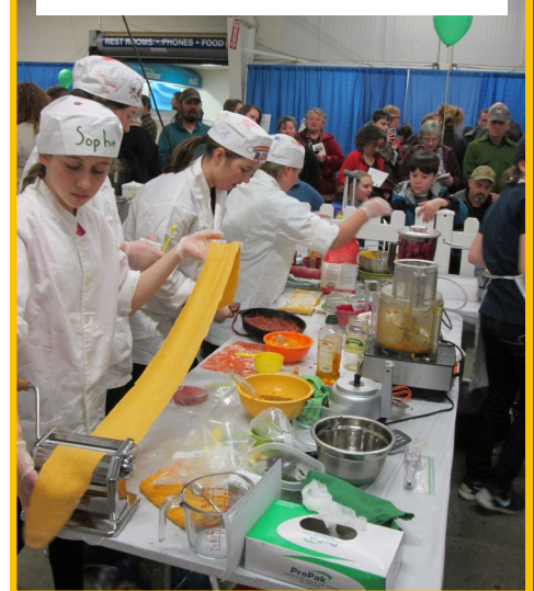
Newark at Jr. Iron Chef Competition