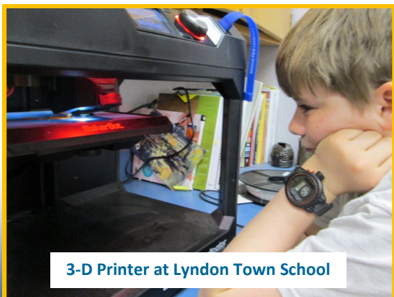
3-D Printer at Lyndon Town School