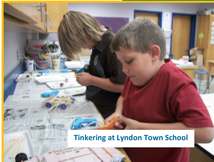
Tinkering at Lyndon Town School

Scholarships are Available—See School Principals