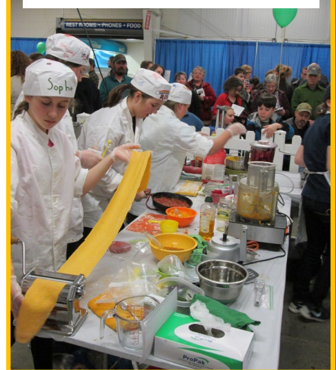
Newark at Jr. Iron Chef Competition